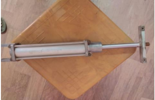
Figure.3. Pneumatic cylinder

Figure.2, represents the two stroke petrol engine used in the experiment. Pneumatic cylinder is used to operate the brake lever (Figure.3).