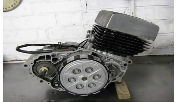
Figure.2. 2 stroke petrol Engine

Figure.2, represents the two stroke petrol engine used in the experiment. Pneumatic cylinder is used to operate the brake lever (Figure.3).