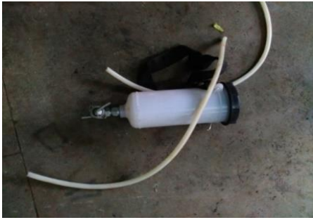
Figure.1. Fuel Tank

Two stroke engines completes the full cycle in every two stroke movement of the piston. Where as in four stroke engine piston travels four strokes. Stroke length represents the distance covered when piston moves from top to bottom dead centre or bottom to top. In the proposed model two stroke petrol engine is used. Fuel tank is shown in the figure.1.